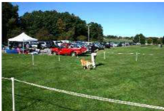
Site of the 2010 CCA Specialty

If you would like to volunteer to Chair the next Specialty Match, please contact Cheryl Brown cbchinooks@comcast.net with the following details: available match site(s), possible date(s), estimated number of Chinook dog entries, and approximate number of volunteers available to staff a specialty committee.