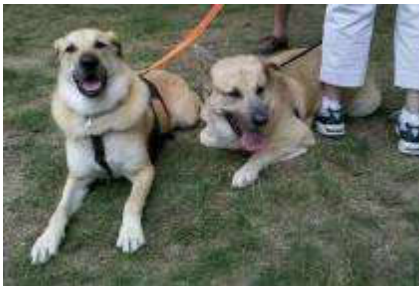
Ranson and Fionn

Eleven Chinooks were entered in the breed ring and twenty Chinooks were in attendance including Tullibardine's Kan and Kenai, Belfast, Ransom, (who looks just like his Mom, Jessie), Fionn, Huck and Birr, (who are all Jackson grandkids). Half of the Riverstone litter of April 2010 attended: Basil, Belle, Rhys, and Kenzie delighting all as they made their debut in the puppy class ring.